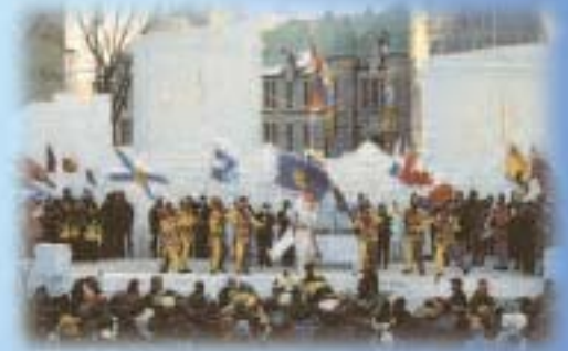
Carnaval de Québec

Montreal/Quebec City: The Museum of Fine Arts, Biodome, Montreal Tower, Botanical Gardens, Olympic Park, Dufferin Terrace, Chateau Frontenac, Citadelle/Royal 22nd Regiment Museum, Chute Montmorency, the Shrine of Sainte-Anne-de-Beaupre.